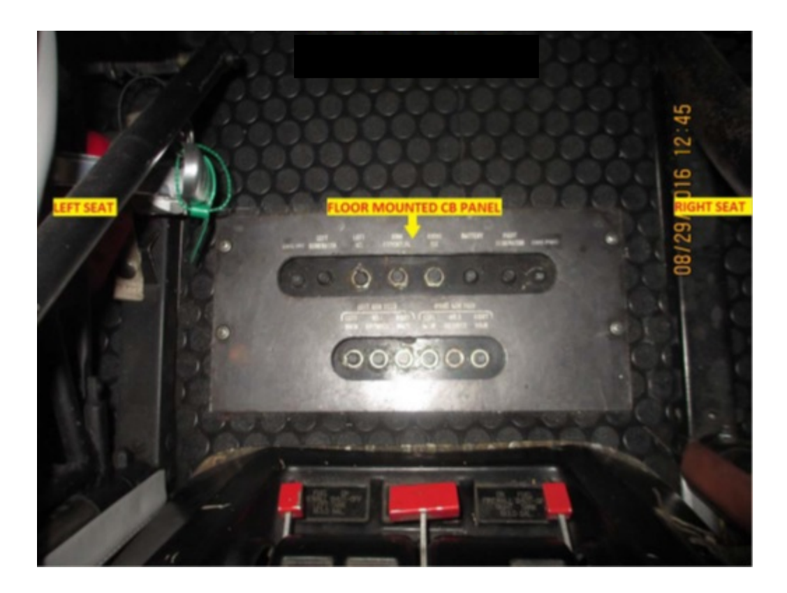
Figure 2 – Example of Floor Mounted CB Panel – Interior (1981 and later production)