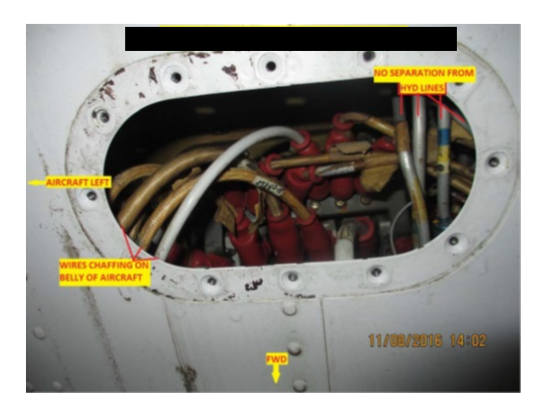
Figure 5 – View of the Area with inspection panel removed