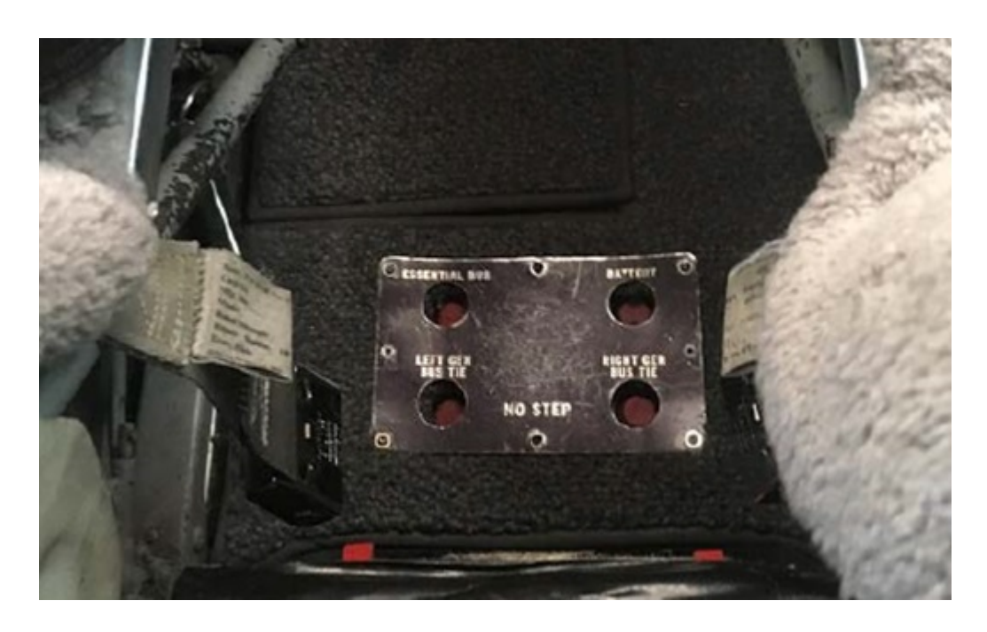
Figure 3 – Floor Mounted CB Panel – Interior (Typical of pre-1981 production)