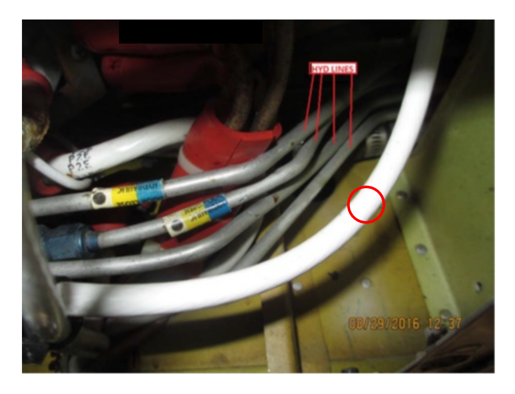
Figure 4 – View of the Hydraulic Lines in close proximity with electrical wires