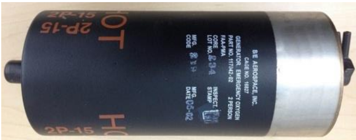
Figure 2 – MFG.DATE (05-02 = May 2002) example