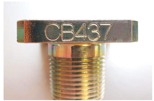
Figure 2 - Machine Engraved Flanged Adaptor

Affected Flanged Adaptors can be alternatively identified by the presence of machine engraved part numbers. Below figure 2 is an example of an affected machine engraved Flanged Adaptor.