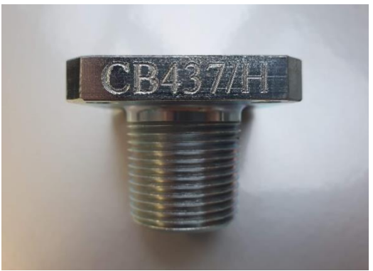
Figure 3 - Replacement Flanged Adaptor 'H'

The above machined engraving must not be confused with hand stamped part numbering. Flanged Adaptors identified with hand stamped markings are unaffected. Below figure 4 is an example of an unaffected hand stamped Flanged Adaptor.