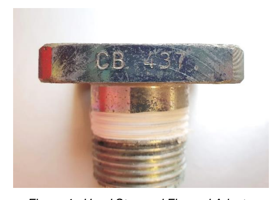
Figure 4 - Hand Stamped Flanged Adaptor