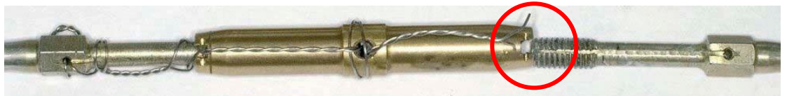
Fig. 1 Picture of the failed Turnbuckle: As shown in the red circle, the safety wire was cut by the groove originally designed to accommodate a locking clip. As a result, the flight control cable end at the right of the picture unscrewed and eventually got loose

The probable cause of the accident was identified as the improper locking of a turnbuckle (Locking Clip missing) and subsequent inadvertent release of the pitch up control cable from the turnbuckle: