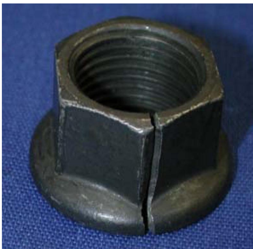
Figure 3: Example of longitudinal crack.

Note: The nut should be tested for wrenching torque by the use of a box or a socket wrench.